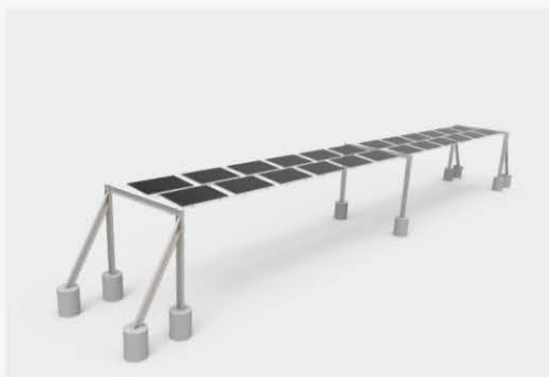
Flexible Mounting System

Grace Solar-Smart Flexible mounting solution is an architectural form that fix solar modules between the buildings .It has significant advantages when applied in large span areas, such as rivers, sewage treatment plants, orchard nursery and other areas where continuous pile posts cannot be placed. Through the four installation methods of hanging, pulling, hanging and bracing, the Grace Solar-Smart Flexible mounting solution can be installed freely in many directions, which can better improve the support method of distributed solar power plant especially C&I markets.